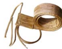
Lab and Industrial Heating Tapes