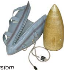
Custom Heating Jackets