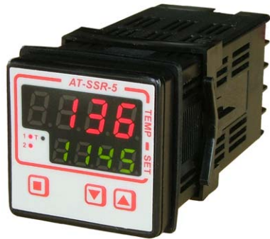
1/16 DIN, Dual Display, 2 Outputs